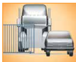
adjustable partial open for different opening distances