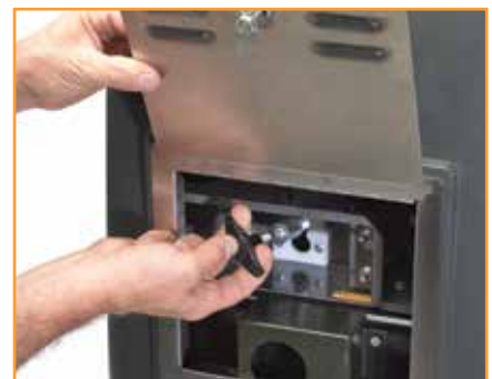
easy to use "T-Handle" release