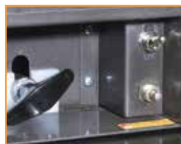
built in power switch and reset switch