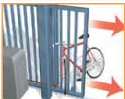
entrapment detection reverses gate when obstructed